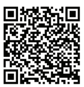
Learn more about TWC training grants.

Texas Southmost College TSTC – Harlingen