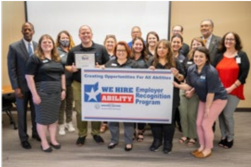
Recognizing Bloom Consulting of Round Rock, TX for efforts in hiring people with disabilities.