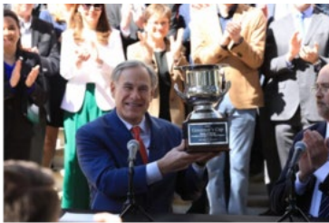
Governor Abbott receiving the Texas Governor's Cup for the 10th year in a row.